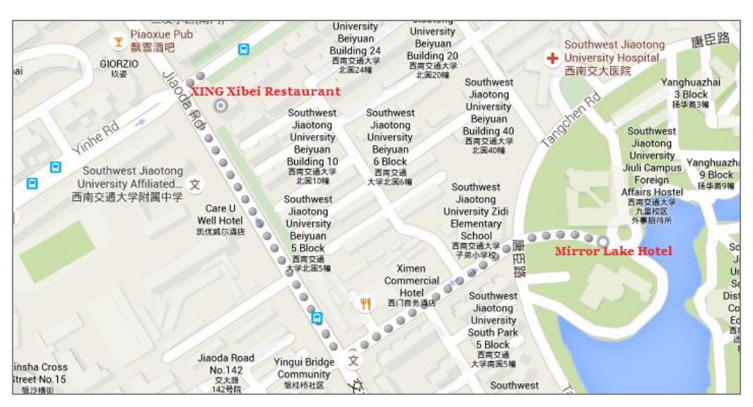
376 Qunxing Rd Jinniu, Chengdu, Sichuan China

DIRECTIONS: 8 minutes' walk from Conference Venue